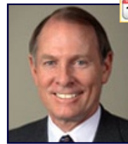
Skip NETZORG DENVER