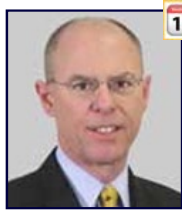
Sandy BROOK DENVER